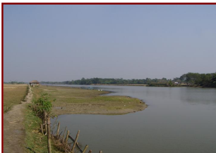
Figure 1 - The natural habitat of the zebrafish

They can typically be found in standing or slow-moving bodies of water, such as pools, ponds, lakes, ditches or rice paddies and would appear to be a floodplain rather than a true riverine species (Vargesson 2007, Delaney et al 2002, Spence et al 2006a). Field studies have found zebrafish at sites that are silt-bottomed and well-vegetated, with shallow and relatively clear water where they appear to occupy the whole of the vertical water column (Engeszer et al 2007, Spence et al 2007).